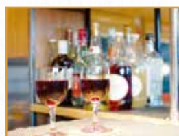
Onboard sale of local shochu and wine