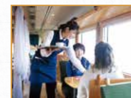
Free coffee roasted over the heated lava plate from Mt. Aso