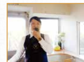
Sightseeing information by cabin attendant