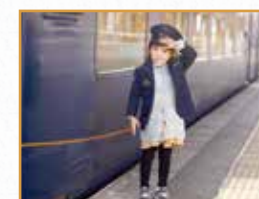
Try on the train operator's uniform and cap