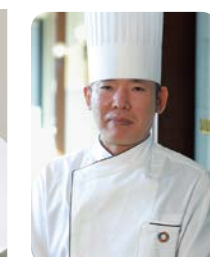
S CUBE HOTEL by SHIROYAMA (Satsuma Sendai)

I gained experience in the Western food section of a restaurant in Osaka and the Sky Lounge at the local Shiroyama Hotel Kagoshima before joining the SCUBE HOTEL. I aspire to make French cuisine accessible and casual so people can enjoy it with a smile.